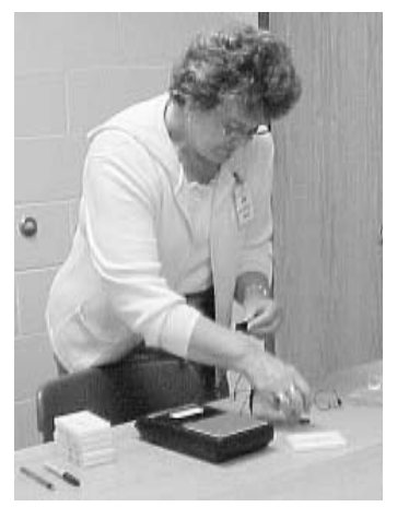
1. Volunteer "engineers" set up recorders before fathers arrive.