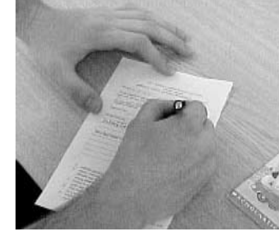
5. A store order is filled out, except for the amount of postage, and signed.