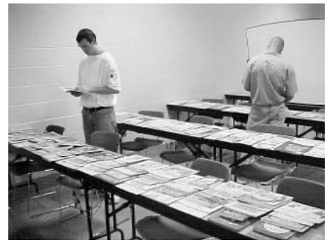
2. Fathers select books to read to their children. Books, cassettes and envelopes are donated by outside congregations and individuals.