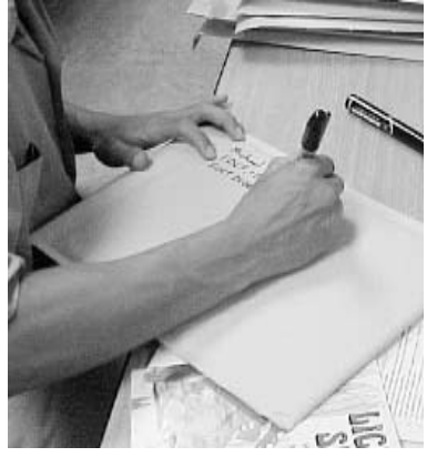
6. The envelope is addressed to the child or in care of parent or guardian.