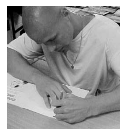
4. A brief message may be written in the front of the book.