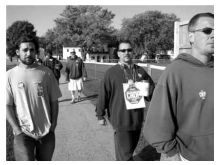
NCCF CROP Walkers

November 2007 through October 2008 total contributions: