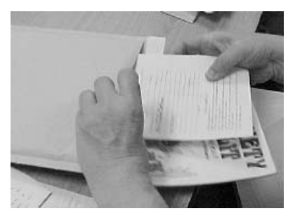
7. Book, tape and store order are stuffed in envelope and taken to mail